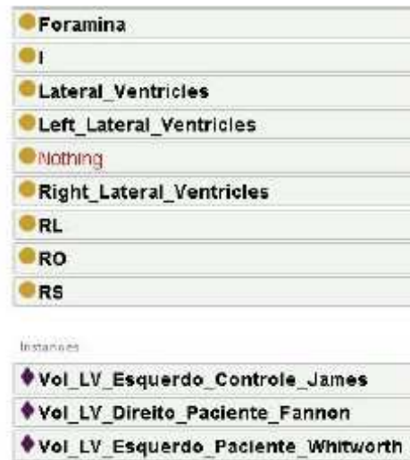
Figure 3. Ontological Query Result

An example of an ontological query is: “Which structures compose the ventricular brain system ?” This query in Protégé (using Manchester syntax) becomes “PP only Ventricular_Brain_System” and results in all classes that compose the ventricular brain system. Figure 3 shows us a part of some of these results.